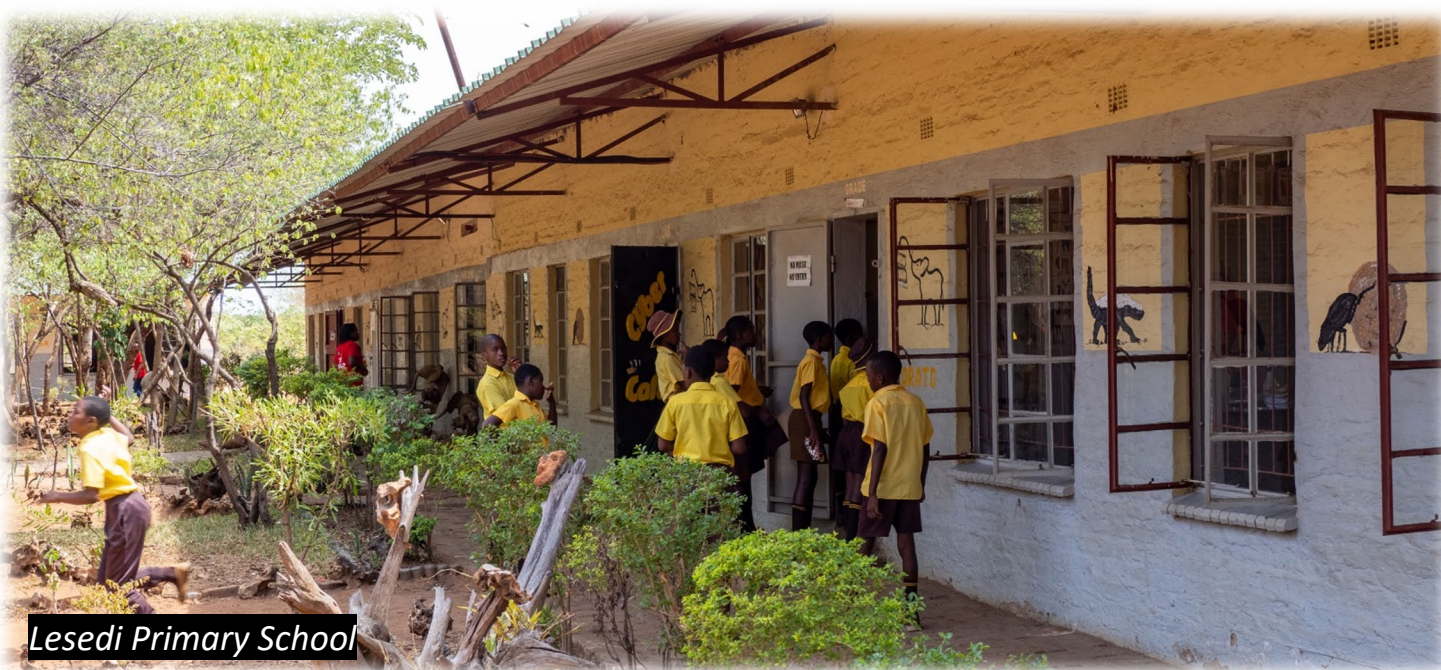
Lesedi Primary School

At the time of writing 281 children are enrolled at Lesedi Primary – 146 boys and 135 girls.