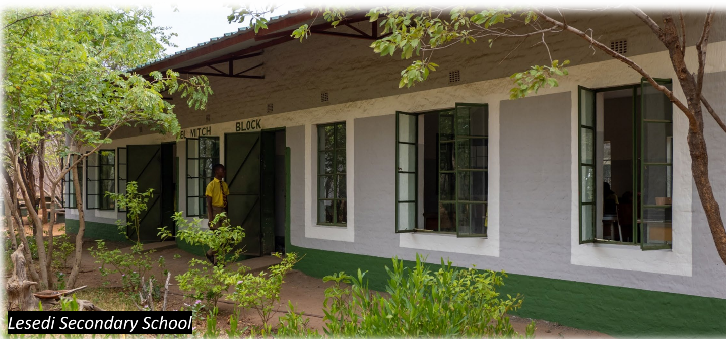
Lesedi Secondary School

The Secondary school was formally annexed to Mosi-oa-Tunya Secondary school (the main 1,600+ pupil school in Victoria Falls town) for registration purposes