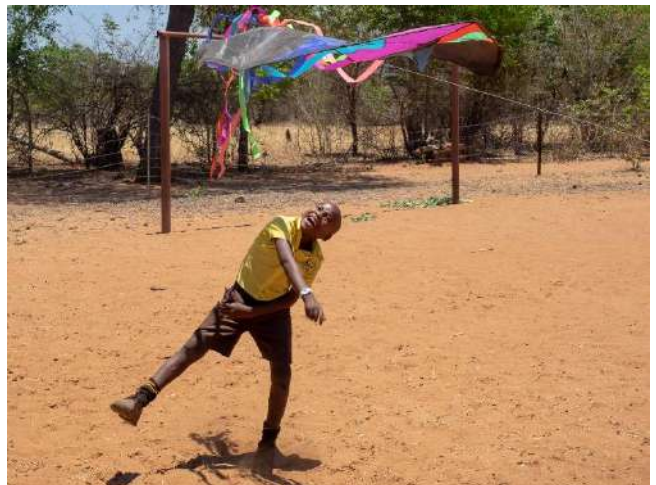
Launching a kite (avoiding the electricity pylons!!)