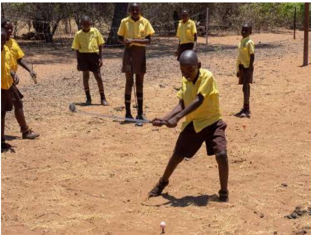
Perhaps not quite the recommended golf posture?

And to finish off this rather lengthy report, a few bonus photos for those of you who read to the end: