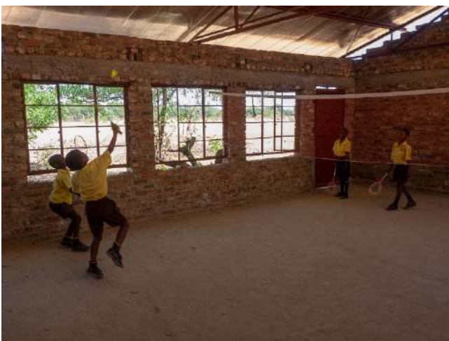
Badminton in our new classroom block