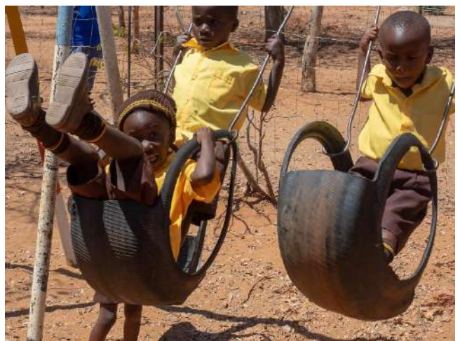
Fun on the swings