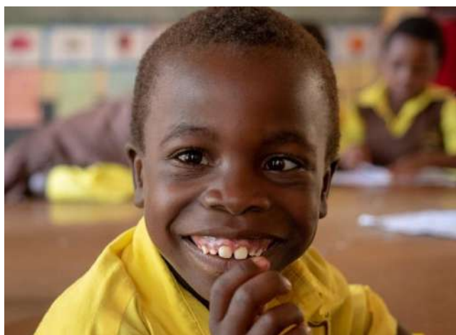
Some of our sponsorship pupils in class