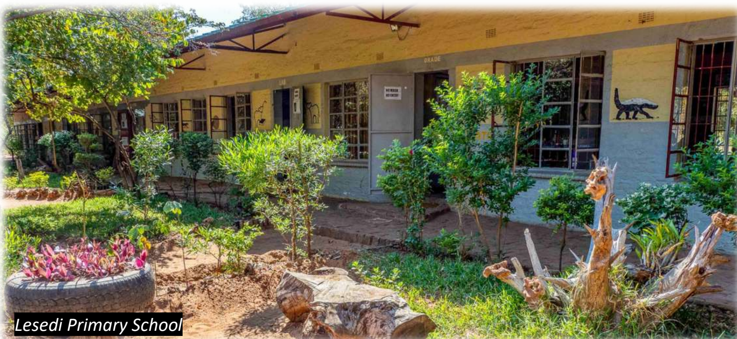
Lesedi Primary School

At the time of writing 280 children are enrolled at Lesedi Primary – 143 boys and 137 girls.