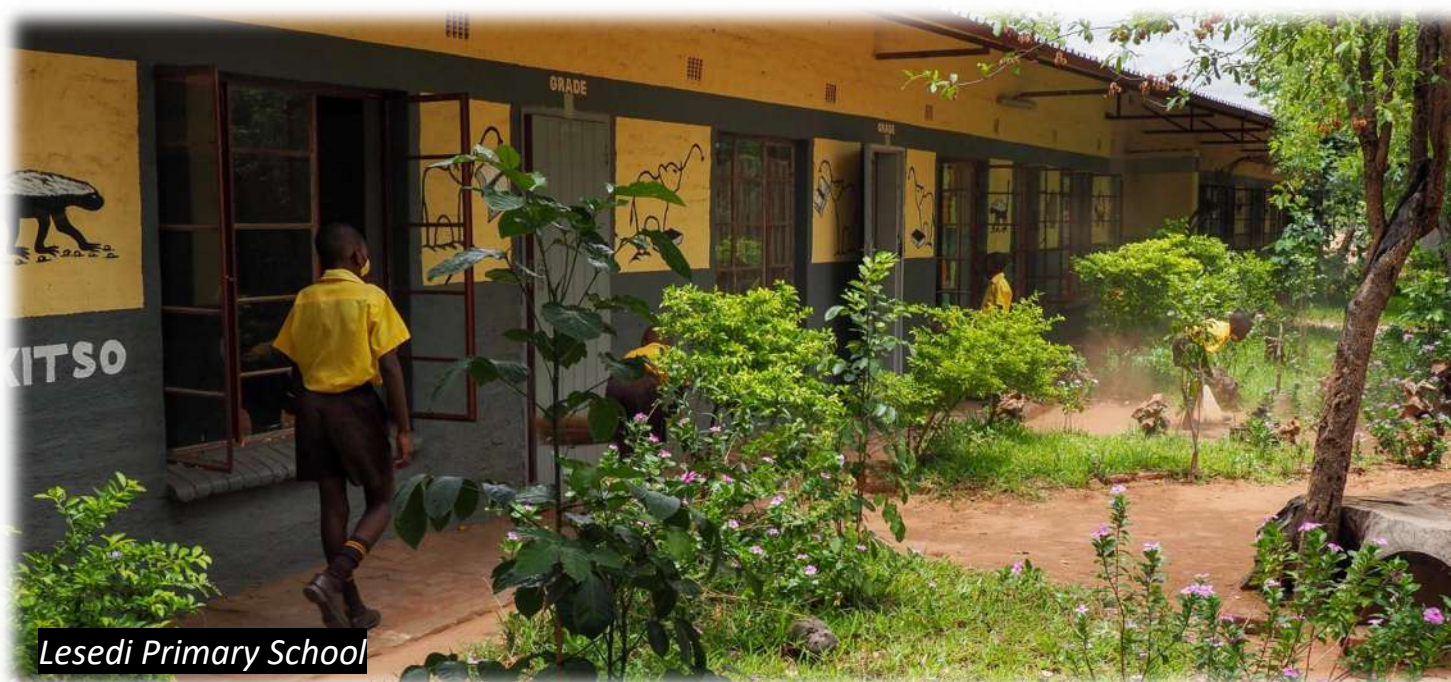
Lesedi Primary School

At the time of writing 292 children are enrolled at Lesedi Primary – 151 boys and 141 girls.