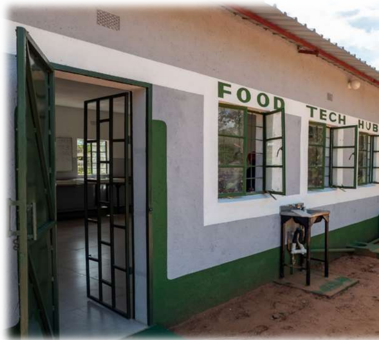
Lesedi Secondary Vocational Blocks Nearing Completion